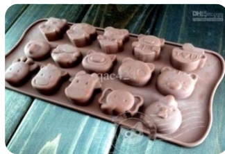
Fig. No. 6