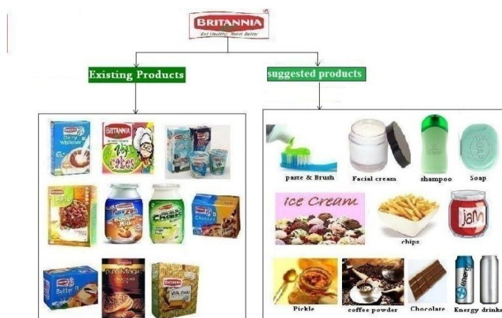
Fig. No. 1 Britannia Products