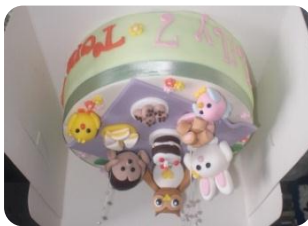
Fig. no. 5