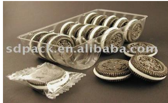
Fig No. 3