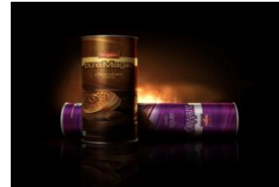
Fig. No. 4