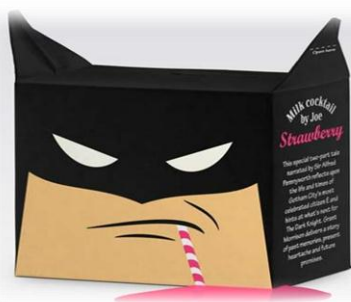
Fig. No. 7