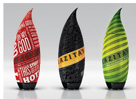
Fig. No. 8